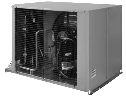
Typical Outdoor Hermetic Unit