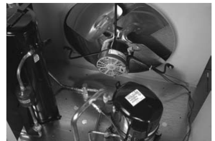
Typical Outdoor Unit with throwaway liquid-line filter and sight glass