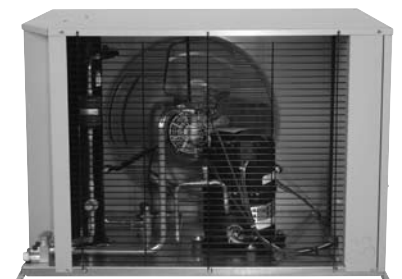
Typical Outdoor Hermetic Unit with liquid filter drier and sight glass